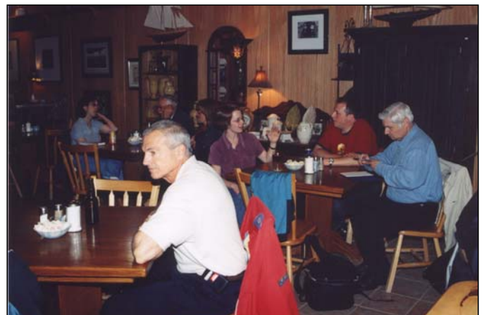
Awaiting the pork banquet on Friday night.