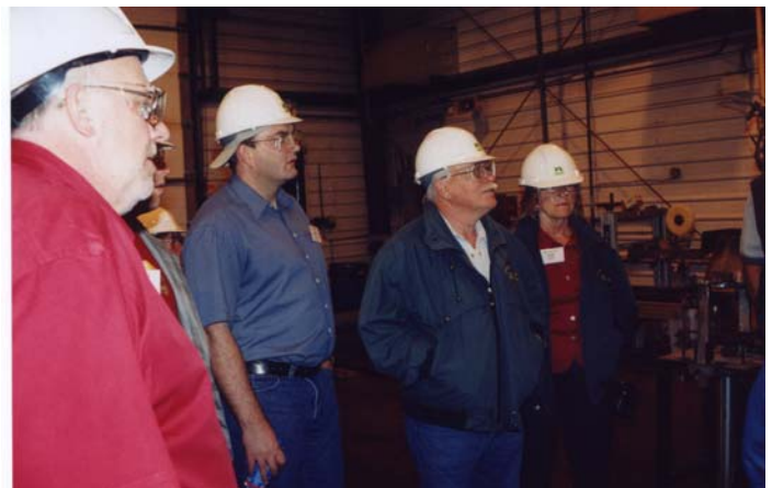
Hard hats were de rigueur at Nufarm.