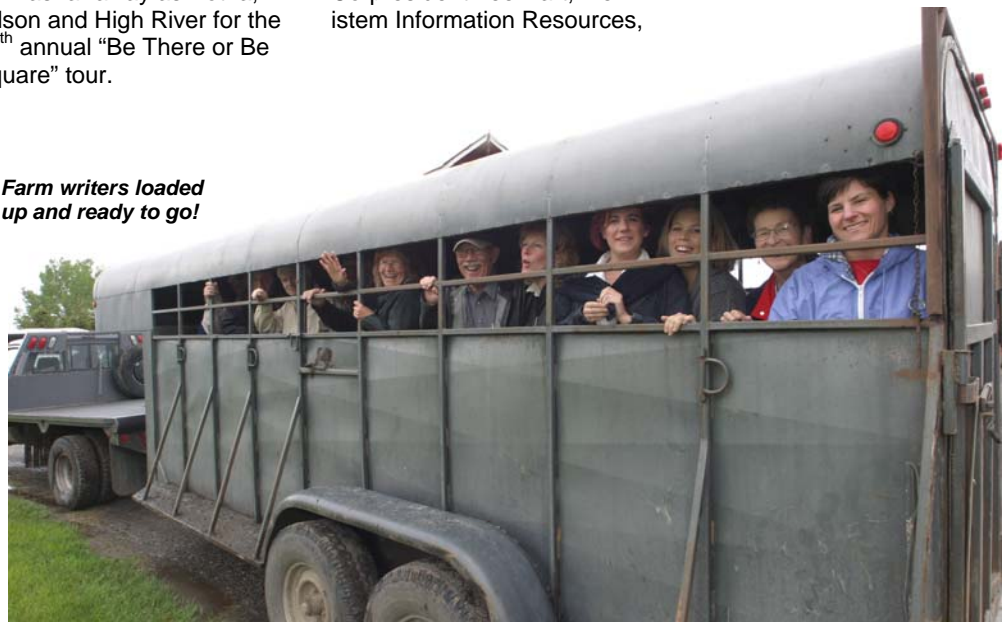
Farm writers loaded up and ready to go!