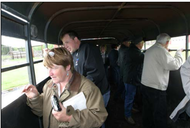
The "scenic" tour.